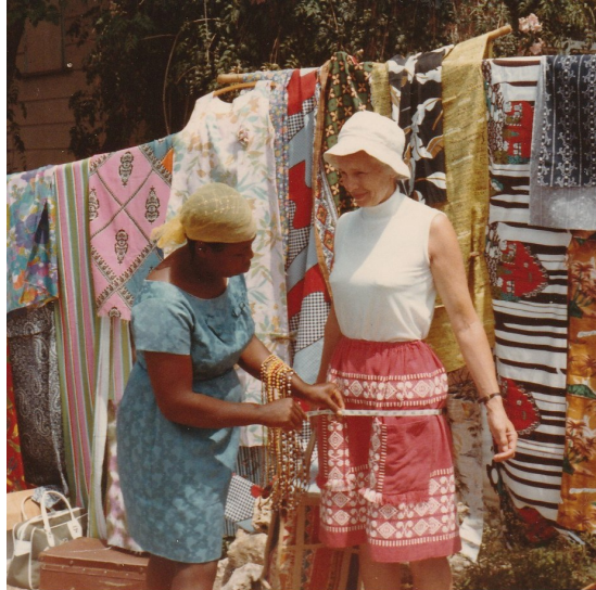
MEASUREMENTS FOR DRESS MADE BY